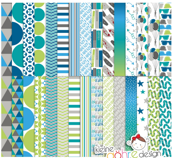
digitale Papiere "Lesen Muster"